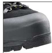
Rubber toe and heel protection