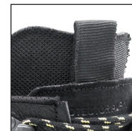
Double tongue for excellent pressure distribution and adjustment