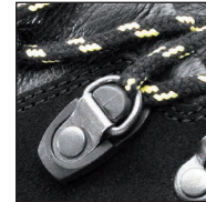
HAIX® 2-Zone Lacing